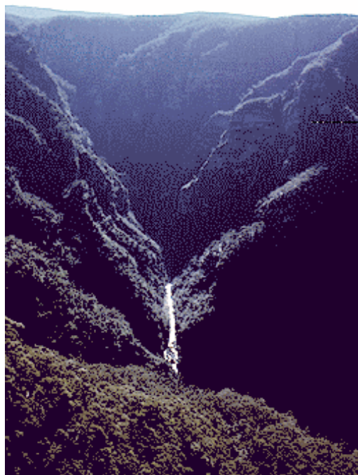
Kanangra-Boyd National Park