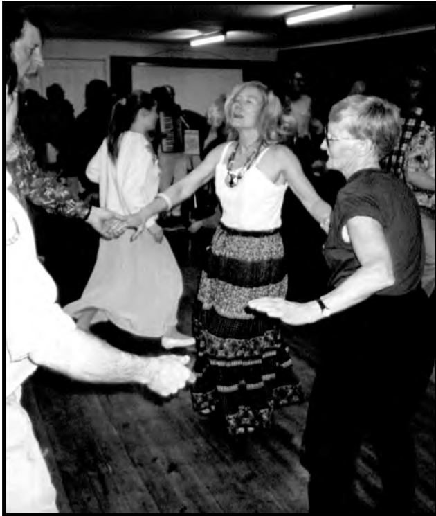
Rocking at the AGM - Canberra

Most of the 11 foundation members were originally from Melbourne, Sydney and Hobart clubs. Membership soon grew to about fifty. Petrol was rationed in the early years, so walks were mostly