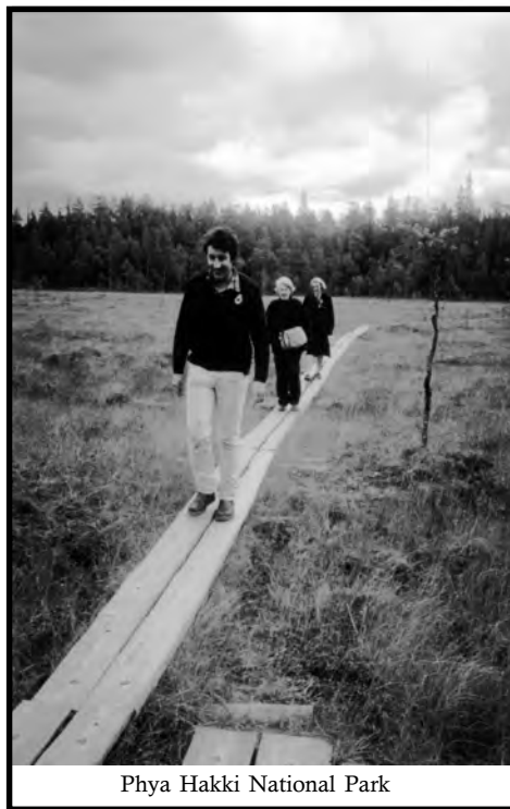
Phya Hakki National Park