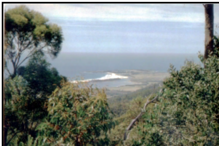
Douglas-Apsley National Park Tasmania

records only the names of Russian winners! (The three Baltic states were under Russian occupation until about 1990)