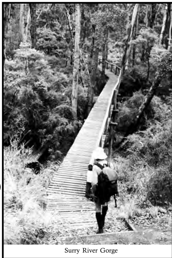
Surry River Gorge

For three days the track followed the river, approaching at the low, landing sites, retreating as the high cliffs at the outside bends dictated.