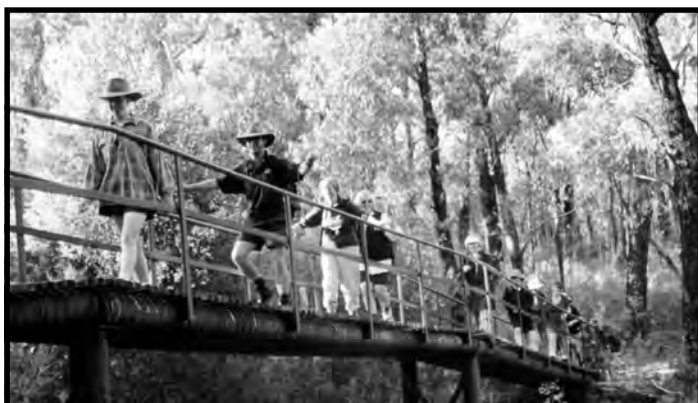
Bridge built by the Friends of the GSWW

here have suffered from an extended dry spell and the colours have been somewhat flat. Now, the change at Cobboboonee, from sandy, dune soil to the richer basaltic soils originating from Mount Deception to the north has revitalised the forest. We now see Blackwood ( Acacia melanoxylon ), a highly prized furniture timber. Manna Gums are present but Koalas remain elusive.