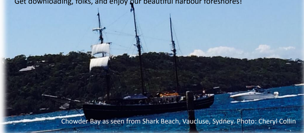
Chowder Bay as seen from Shark Beach, Vaucluse, Sydney.

Get downloading, folks, and enjoy our beautiful harbour foreshores!