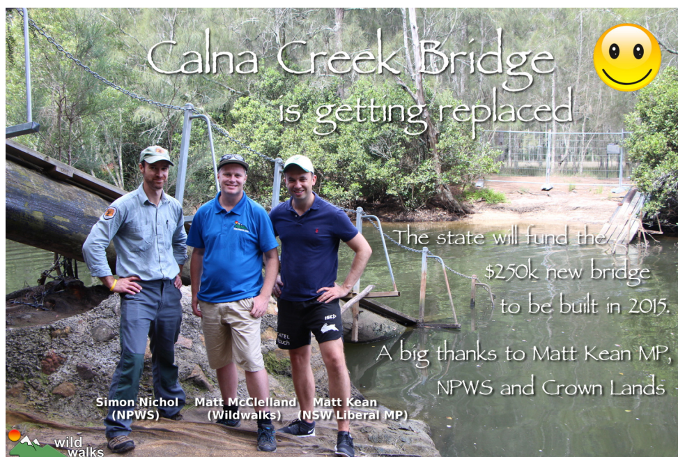
Calna Creek Bridge