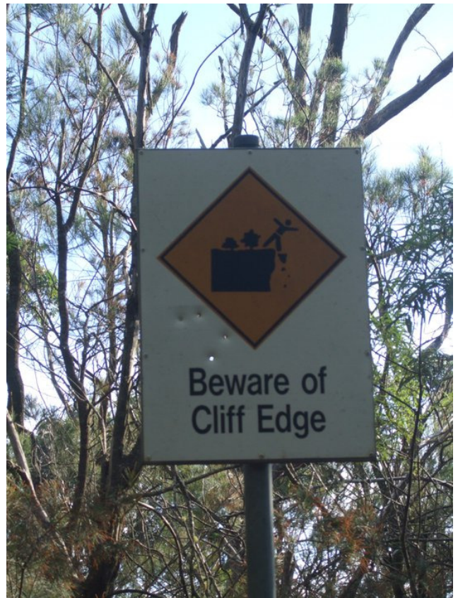
A slightly worrying but very helpful sign near Tidbinbilla.

Congratulations and thanks to all committee members - and good luck!