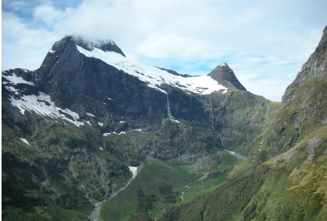
From the Milford Track in New Zealand