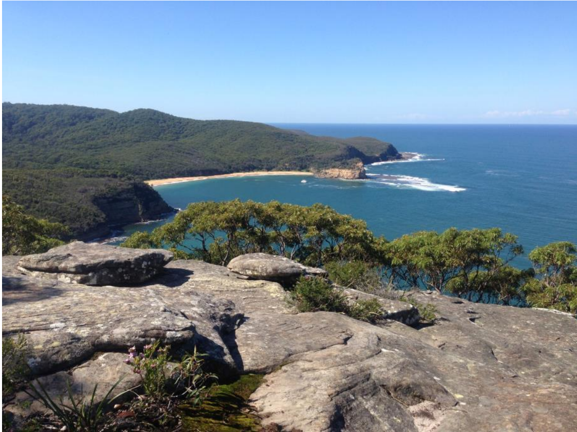
Beautiful Bouddi National Park on our Central Coast