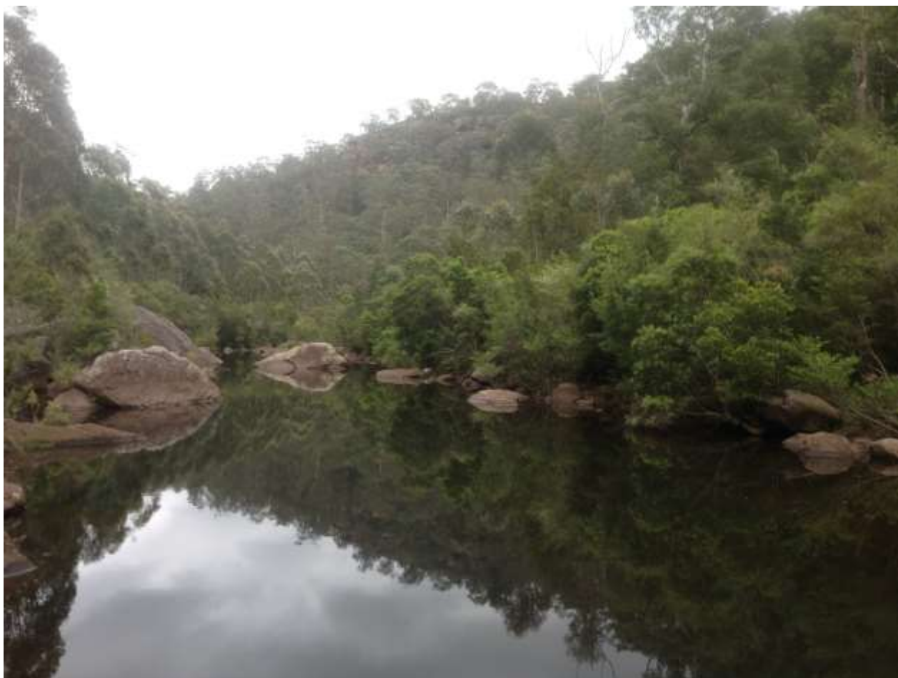
Erskine Creek in Blue Mountains National Park