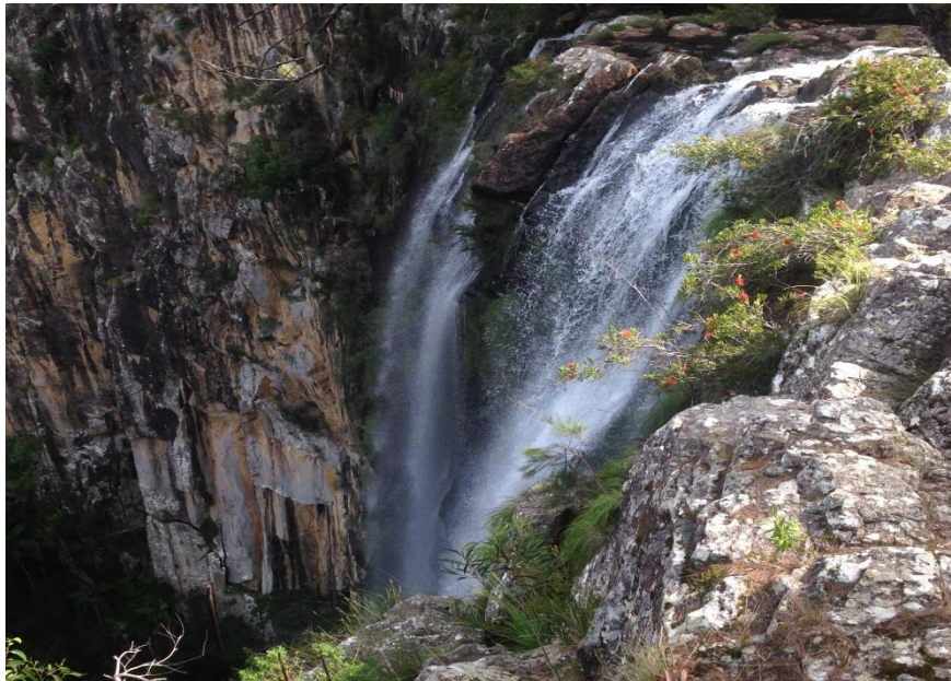
Minyon Falls – Nightcap National Park