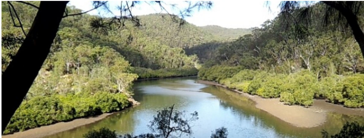
Ku-ring-gai Chase National Park