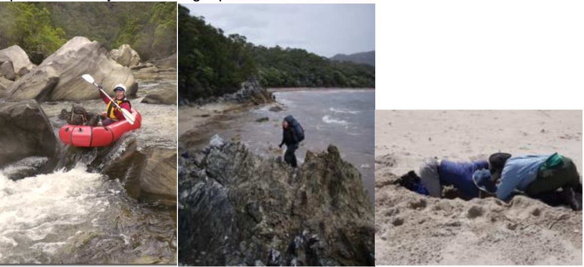
Rafting the Colo. Weeding Tasmania's Wild West Coast.

For example, Carol has journeyed by canoe and pack raft through the depths of the Wollemi Wilderness, weeding willow trees from the banks of the Colo River. Carol has spent up to three weeks at a time walking and weeding the remotest sections of Tasmania's wild west coast in adventures supported by helicopter insertion and food drops, followed by boat and light plane extraction.